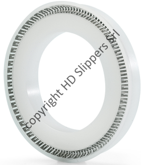
Spring Energized Seals in PTFE PU UHMWPE