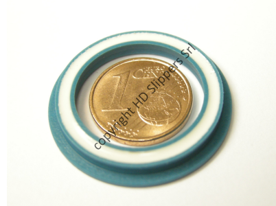
Spring Energized Seals