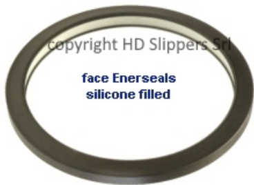
Spring Energized Seals face sealing with silicone filling