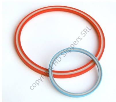
Spring Energized Seals PU with silicone filling